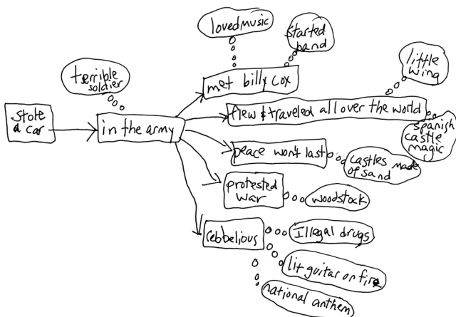
Figure 3. A Showing Causes/Effects Brain Frame constructed by a fifth-grade student while conducting research for a biography project on Jimi Hendrix. The main event under scrutiny is in the center box (in this case, Jimi Hendrix being "in the army"). Causal events are in boxes to the left of the main event, and effects are in boxes to the right of the main event. Arrows show how the events are related (i.e., causes lead to the main event, and the main event leads to multiple later events). Thought bubbles are used to capture associated thoughts/ideas—in essence, metacognitive afterthoughts about items in the Frame. In this case, the thought that Hendrix was a terrible soldier hovers over the main event of Hendrix being in the army. Also, the names of songs Hendrix wrote hover over the life events and beliefs that the student thought may have inspired them.